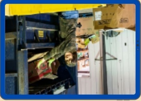
Increase Your Work Capacity